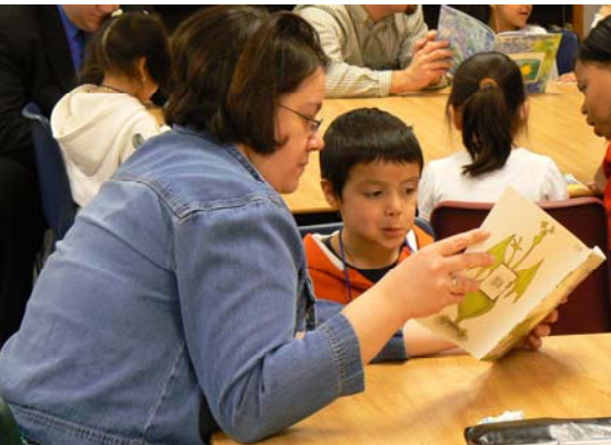
A volunteer reads with a student at the 2008 Bagels and Books event at Lincoln International Studies School.