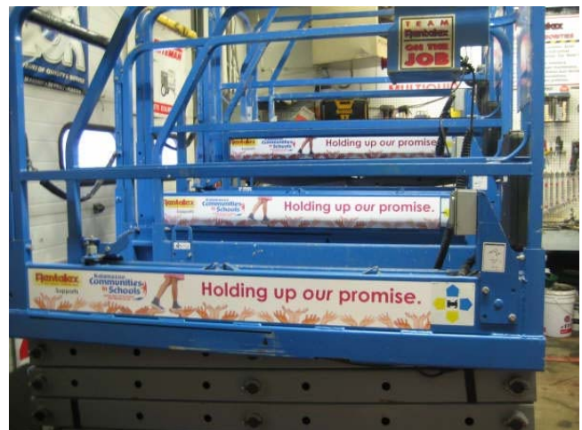
A RENDALEX scissor lift featuring the KCIS logo.